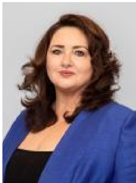
Helena Dalli Commissioner for Equality European Commission.